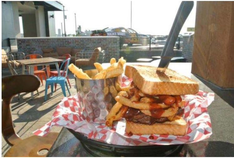
Ricky Bobby Sports Saloon and Restaurant