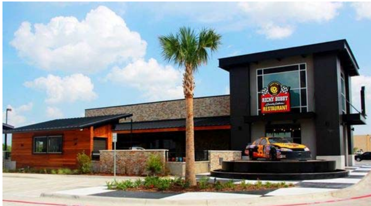
Ricky Bobby Sports Saloon and Restaurant

The Ricky Bobby Sports Saloon and Restaurant has opened on NE Loop 820 in Fort Worth. This NASCAR-themed restaurant is no Applebee's for darn sure, but it'll do. And since we all watch Talladega Nights: The Ballad of Ricky Bobby each and every opportunity we get, we know the wonderful potential a restaurant based on the movie has. This looks like a place Ricky and Cal would be proud of, even if you'll never find them there.