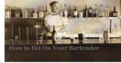
How to Hit On Your Bartender